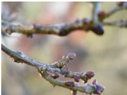
Typical background to video

If required, SysEnvir can help set up a simple non-transactional website for little cost with the video sales product using a UK based third – party ISP.