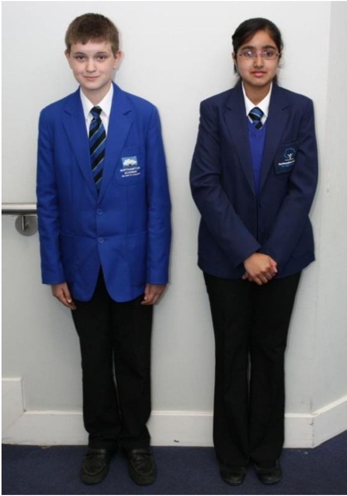
The old blazer