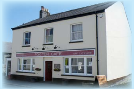
Two Bridges Road, Princetown, Devon, PL20 6QS