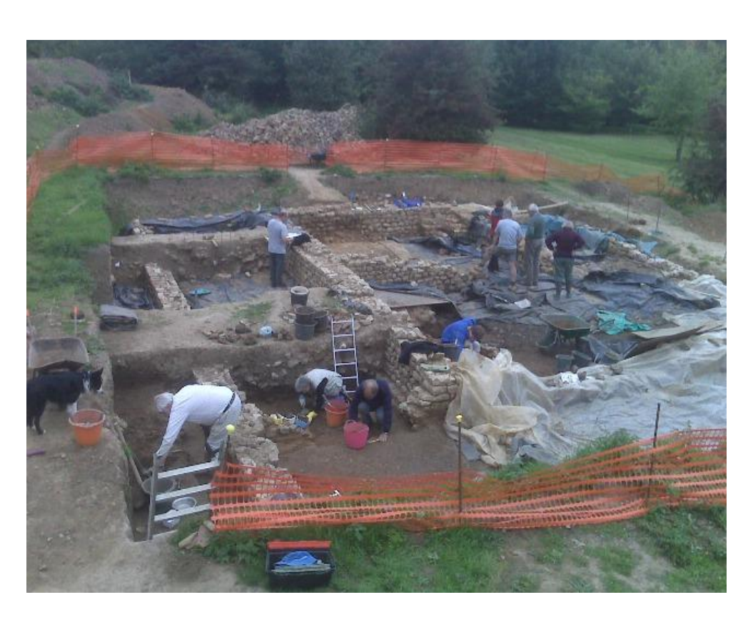
East Farleigh Roman 'temple' site, author, 19<sup>th</sup> September 2010.