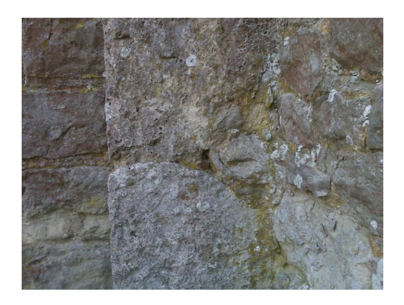
Detail of spolia as above, St Mary's Church, East Farleigh, author, 11 June 2011.