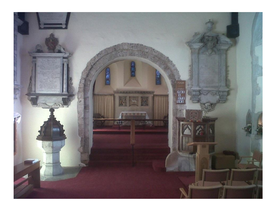
Re-used Roman monumental tufa entrance arch, All Saints Church, West Farleigh author, 11 June 2011.