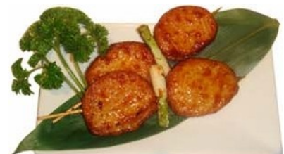
22. Hanpen £3.90 Grilled fish cakes on skewers with yakitori sauce