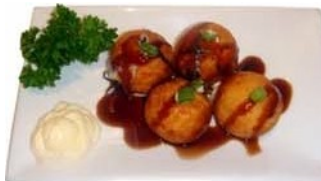
19. Takoyaki £3.90 Deep fried wheat flour with octopus, cabbage and soy sauce filling served with mayonnaise and tonkatsu sauce