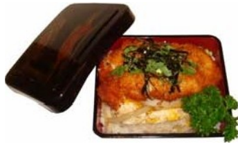
51. Tori Katsudon £7.90 Steamed rice topped with egg, onions and deep fried chicken breast in crispy breadcrumbs