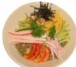
59. Hiyashi Chuka £8.90 Cold green tea soba topped with king prawns, crab stick, fishcake, egg, cucumber, tomatoes, seaweed and served with special home mode sauce

All rice dishes are served with Japanese steamed rice. Change to : Fried Rice or Plain Soft Noodle extra charge £1.00 Soba extra charge £1.50