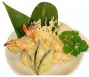
64. Tempura Moriawase £5.50 Deep fried king prawns, sweet potatoes, aubergine, baby corns, mushrooms and soba in light batter and served with tempura sauce