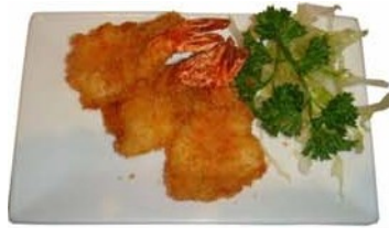
11. Ebi Katsu £3.90 Deep fried king prawn in crispy breadcrumbs