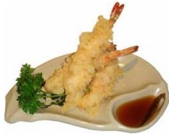
13. Ebi Tempura £3.90 Deep fried king prawn in light batter