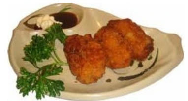
18. Kaki Fry £3.90 Deep fried oyster in breadcrumbs