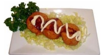
20. Korokke £3.60 Deep fried mashed potato and chicken served with mayonnaise and tonkatsu sauce