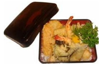
52. Ten Don £8.50 Steamed rice topped with egg, onions and mixed tempura