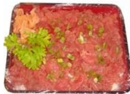
55. Negi Maguro Don £11.50 Steamed rice topped with fresh chopped tuna served with chilli oil, soy sauce, seaweed and spring onion