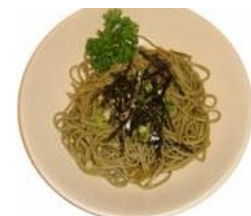
58. Zaru Soba £4.90 Cold green tea soba topped with seaweed, spring onion and served with special home mode sauce