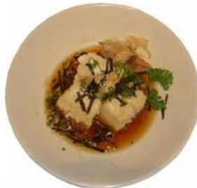
17. Agedashi Dofu (V) £3.50 Deep fried tofu with spring onion and tempura sauce