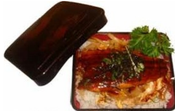
53. Una Don £8.90 Steamed rice topped with egg, onions, grilled eel and seaweed