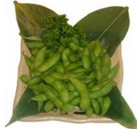
14. Edamame (V) £2.90 Salted green soya beans