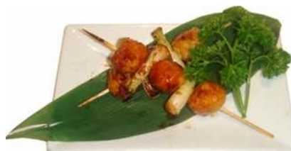
21. Tsukune £3.50 Grilled fish balls on skewers with yakitori sauce