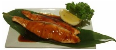
61. Sake Teriyaki £5.80 Teppanyaki salmon served with teriyaki sauce