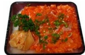
56. Negi Sake Don £9.90 Steamed rice topped with fresh chopped salmon served with chilli oil, soy sauce, seaweed and spring onion