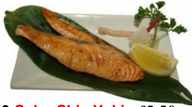
60. Sake Shio Yaki £5.50 Teppanyaki salmon with soft