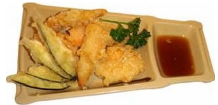
12. Yasai Tempura (V) £3.50 Deep fried mixed vegetables (aubergine, sweet potato, mushroom & baby corn) in light batter