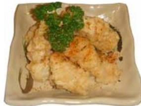
15. Ika Ten Piri Kara £3.90 Deep fried squids with spicy powder