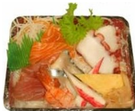
57. Chirashi £13.50 Japanese sushi rice topped with fresh king prawn, tuna, crab stick, salmon, egg, octopus and mackerel