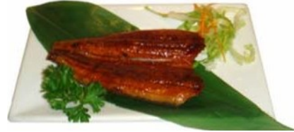
63. Unagi Kabayaki £5.90 Teppanyaki eel served with teriyaki sauce