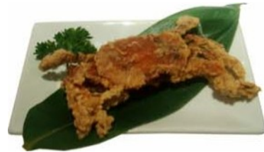
67. Kani Karaage £5.90 Deep fried soft shell crab in light butter served with tempura sauce