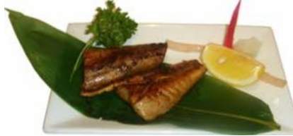
62. Saba Shio Yaki £4.90 Teppanyaki mackerel with soft