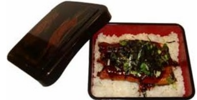
54. Una Jyu £8.50 Steamed rice topped with grilled eel and seaweed