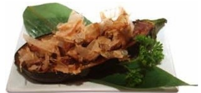
16. Nasu Dengaku £3.90 Deep fried aubergine