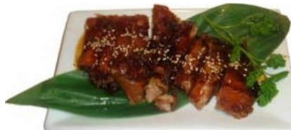
66. Kamo Teriyaki £5.90 Deep fried duck in light batter served with teriyaki sauce and garnished with sesame seeds