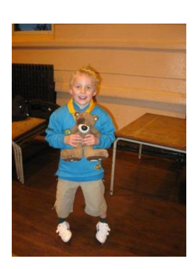
Beaver Of The Week brings his own mascot to the nights action!