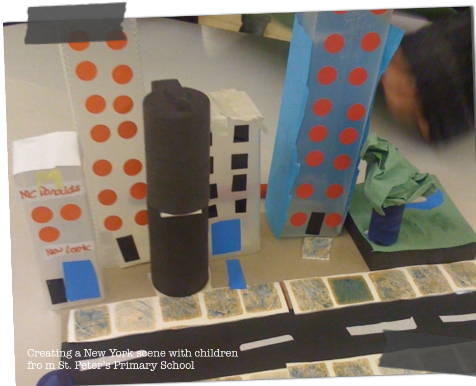
Creating a New York scene with children from St. Peter's Primary School