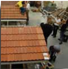
Slating and tiling