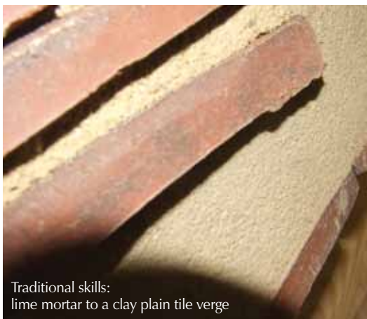
Traditional skills: lime mortar to a clay plain tile verge

"New-build techniques are essential in themselves, but they do not address the requirements for older buildings, which need the understanding of the original construction materials and the techniques and skills to reproduce them."