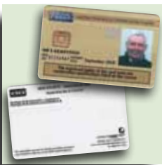
Heritage CSCS cards