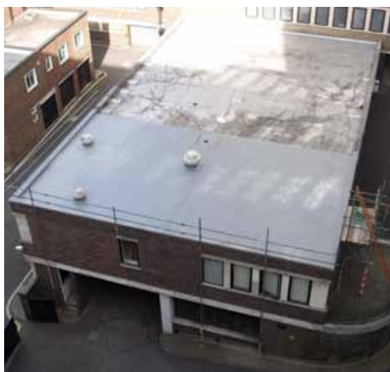
Watertight: a recently-completed project at Grosvenor Place, using Cap Roofseal