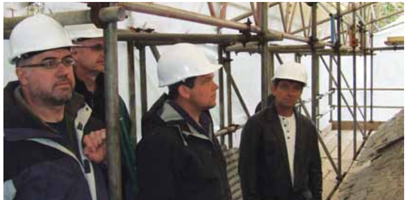
Fact-finding: visit to a Cornish quarry

"The programme also covers the history of