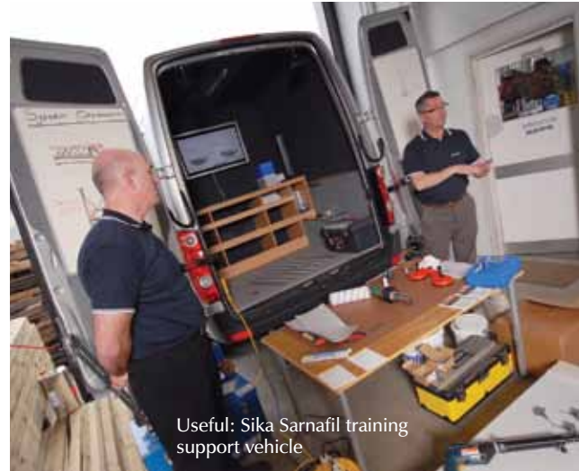
Useful: Sika Sarnafil training support vehicle

SPRA welcomes supplementary training and