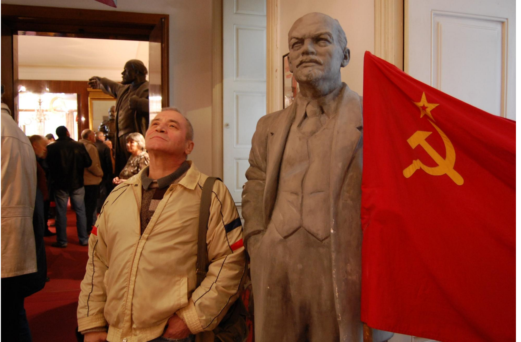
One of our Bulgarian members of the partnership who knew the pose well!