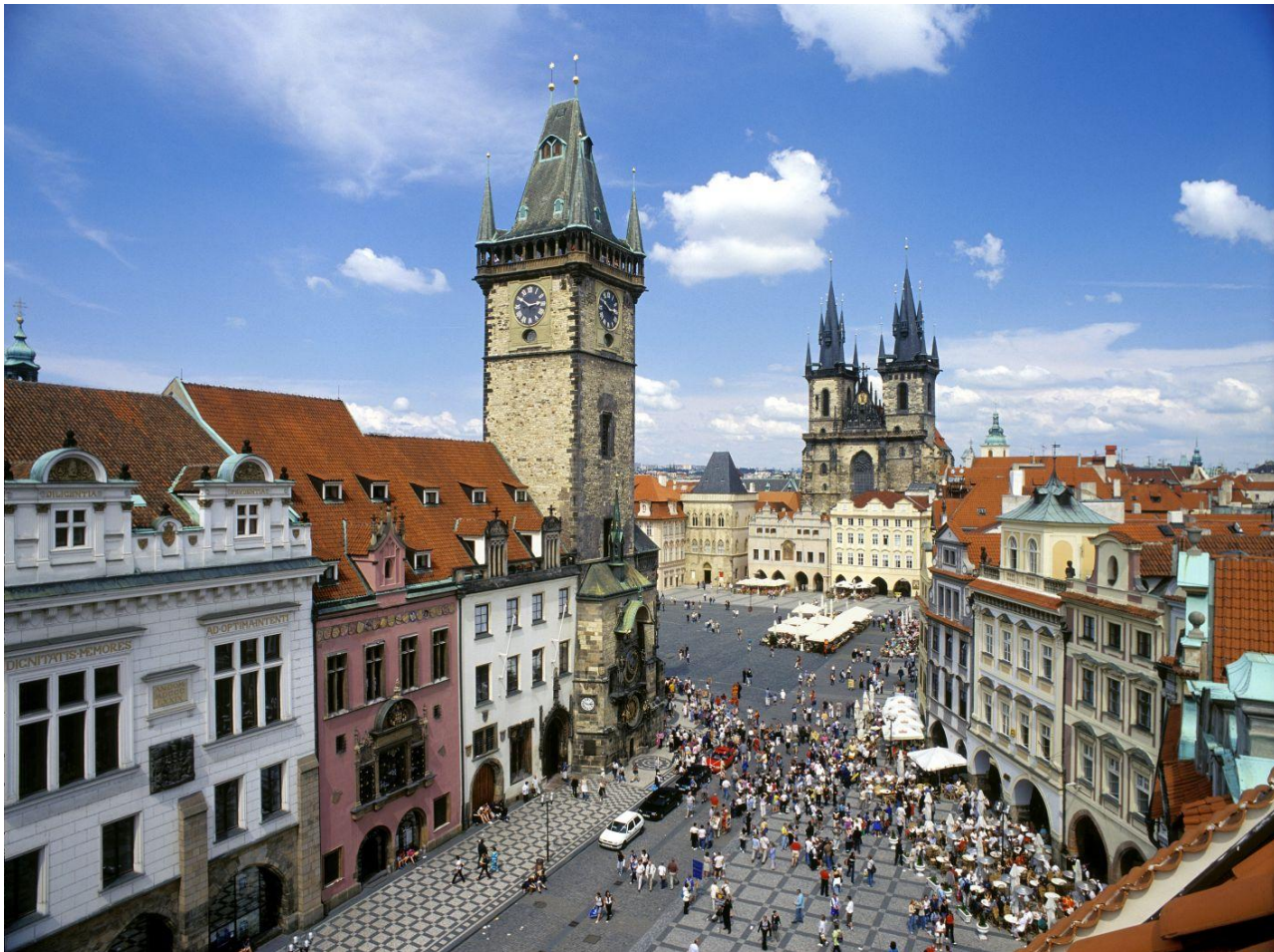
Prague Old Town Square