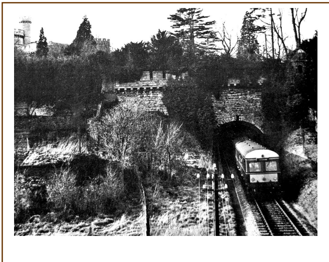
A diesel train emerging from Devizes Castle tunnel towards Pan's Lane Halt - pre 1966.

Below left – a diesel train emerging from Devizes Castle tunnel towards Pan's Lane halt. Below right is the Trowbridge - Melksham line running north with the Devizes branch line going right (just north of Holt junction, see the map above)