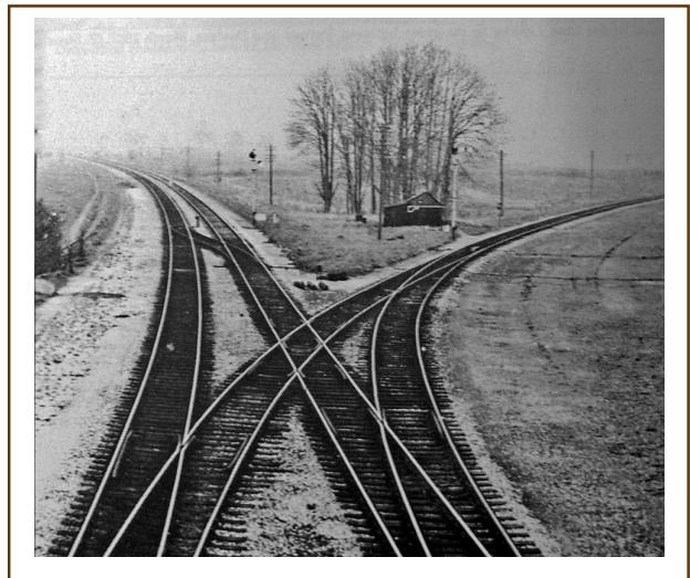
The branch line just north of Holt junction is branching right towards Devizes – pre 1966.